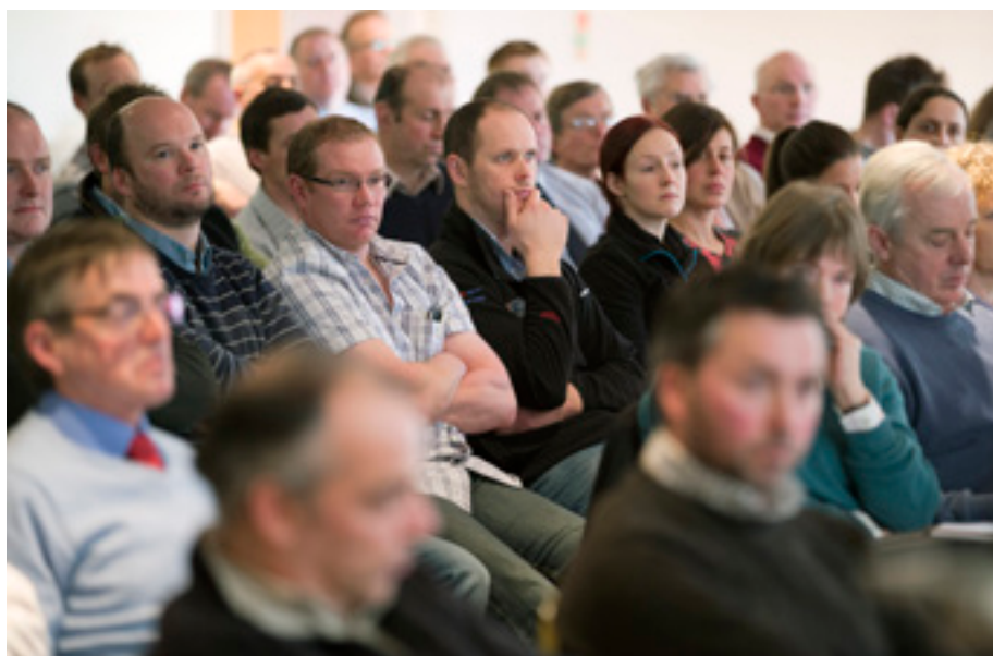
Some of those who attended the Planning for Profit meeting in Perth.