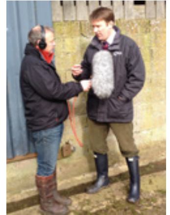
Top left: QMS has a strong presence at the Royal Highland Show.