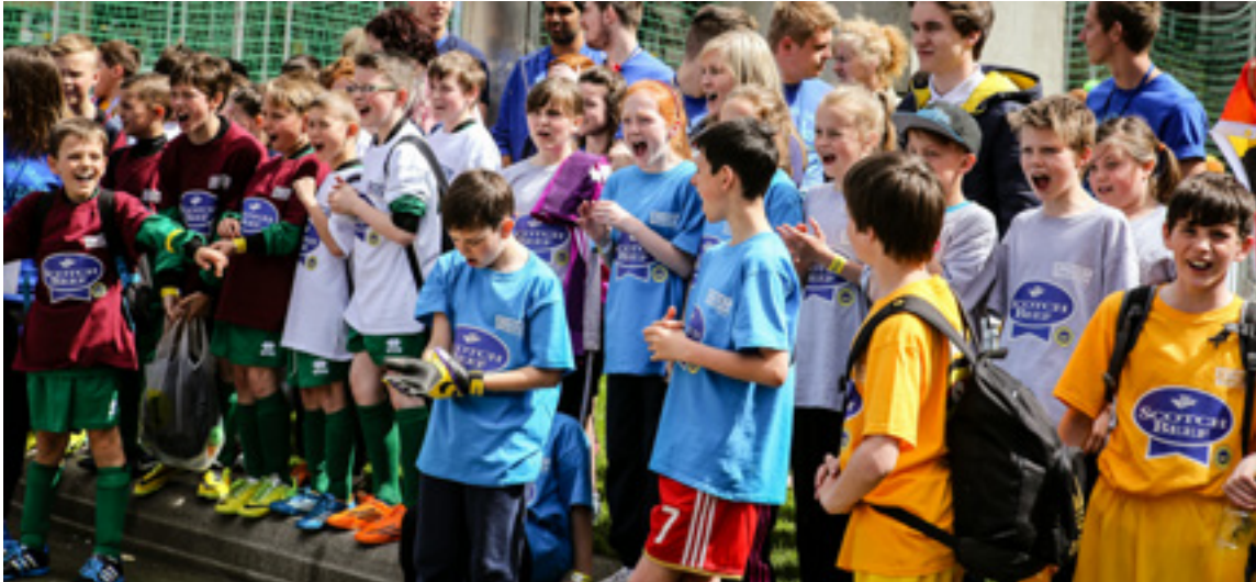
Over 100 school children competed in colourful Scotch Beef T-shirts at a Street Soccer Scotland event with a Commonwealth Games theme in Glasgow's George Square.

QMS's health and education activities are focused on improving Scottish families' understanding of the importance of eating a healthy diet and red meat's role in achieving that.