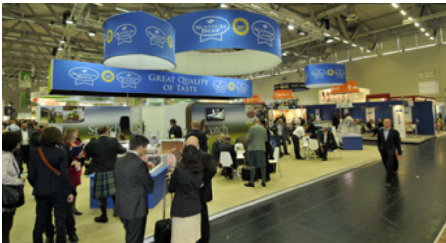
QMS had a major presence at ANUGA in Cologne, the largest food fair in the world, in October 2013.

QMS also works closely with the Scottish Government, Scotland Development International (SDI) and the UK Export Certification Partnership (UKECP), a DEFRA/industry partnership which collaborates with the UK livestock industry to establish export market priorities and free market access in third countries which are closed to red meat imports from the UK.