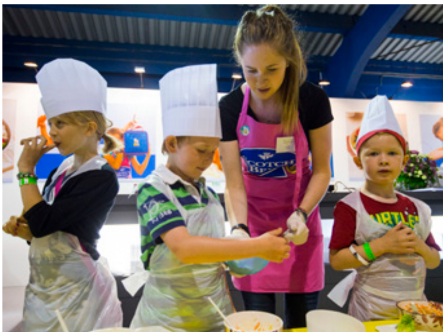
QMS worked with the Royal Highland Education Trust to cook beef, lamb and pork with around 1000 children in the Scotch Beef Children's Cookery Theatre at the Royal Highland Show.