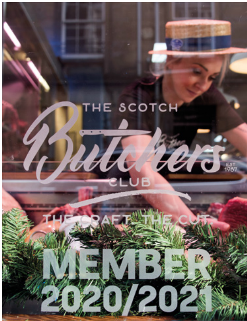
MEMBERS WINDOW VINYL