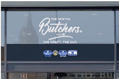
BRANDED WINDOW VINYL