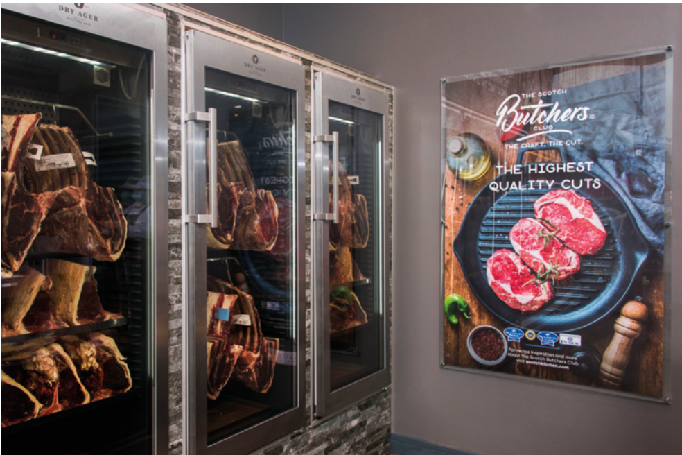
POSTER AND FRAME