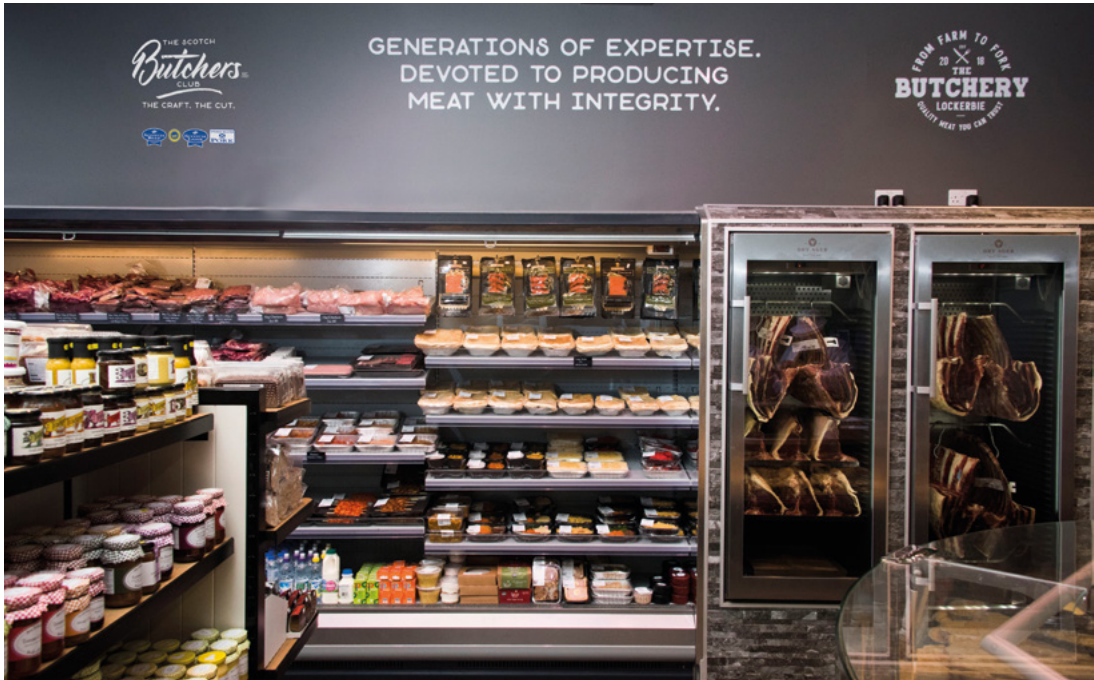
CO-BRANDED WALL VINYL