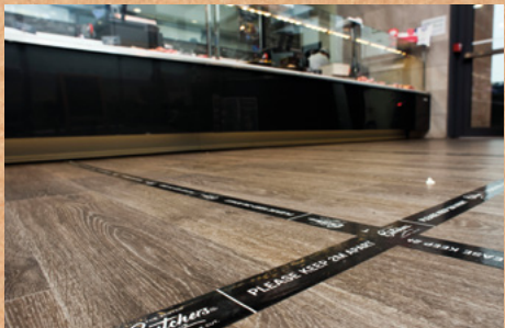
SOCIAL DISTANCING FLOOR TAPE